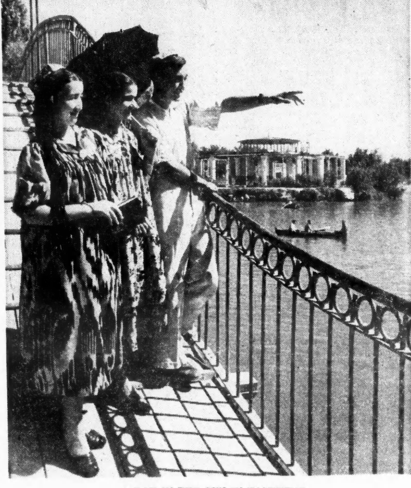
A DAY IN THE SUN IN TASHKENT Young student in a park of the Uzbek capital

LENIN'S THEORY: In the first years of Soviet power, when the Party and the sovernment were trying to work out the status of many nationalities and the re-lations between them, Stalin, according to Muhitdinov, advocated an autonomy of all nationalities and minorities which, to a great extent, would have limited the sovereignty rights of the national repub-