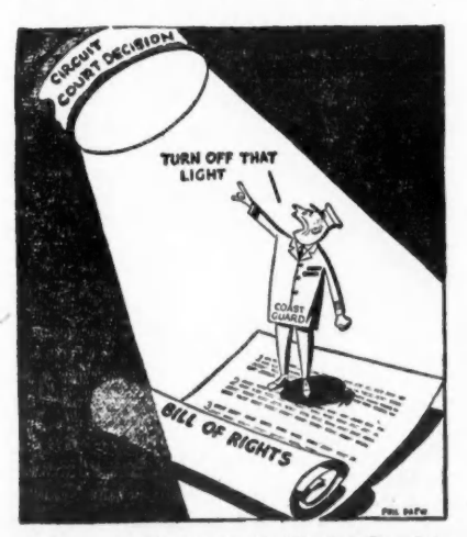
The Dispatcher (ILWU), San Francisco

THE SCREENED SEAMEN: The case arose from a lawsuit filed in 1951 on the West Coast in behalf of six seamen "screened" off the waterfront by the Coast Guard as security risks. A lower court ruling in that year ordered the Coast Guard to present screening vic-tims with a bill of particulars specifying