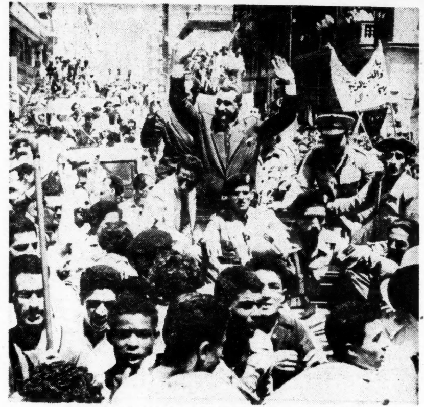
HOW THE EGYPTIANS FEEL ABOUT AN EGYPTIAN CANAL Crowds in Cairo hail Nasser after his Suez announcement

French-American position seemed to be that Nasser's seizure of the canal was "arbitrary," that an international waterway such as the Suez Canal cannot be left—as Eden said—"in the unfettered control of a single power," and that international control was necessary to assure passage of ships of all nations at all times, as specified in the Convention of 1888.