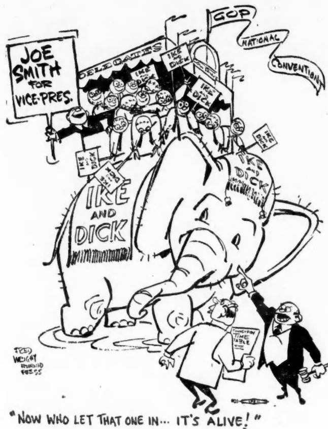
"NOW WHO LET THAT ONE IN... IT'S ALIVE!"