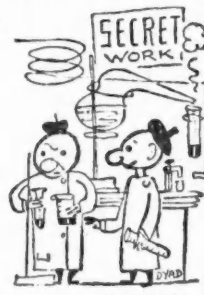
Drawing by Dyad, London

"D'you think we ought to tell 'em abaht mum being in the Co-op?"