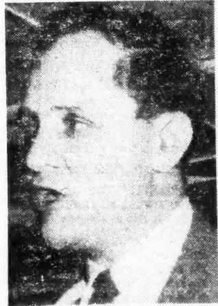
LEONARD BOUDIN Not the main test yet

the U. S. Court of Appeals sent the case back to Secy. Dulles ordering him to grant Boudin a