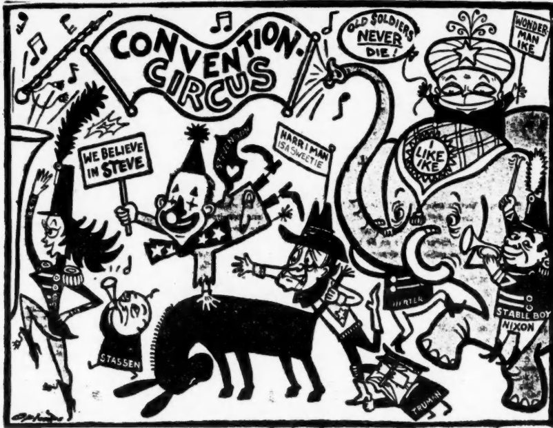
THE GREATEST SHOW ON EARTH

ON PROSPERITY: Meany fended off reporters who quoted him as saying recently that the American worker "never had it so good." He said: "Yes sir, I will stand on that. But I don't think the Republicans had anything to do with it."