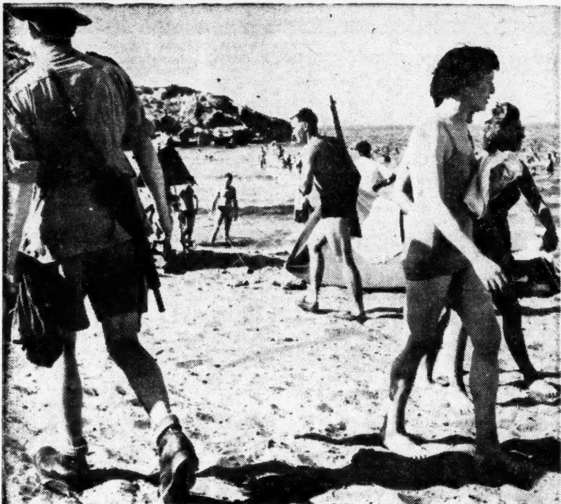
The situation in Cyprus

This is Kyrena Beach just before the truce ended. British troops were allowed to leave restricted areas but took their guns with them (note soldier in center with rifle, another at left with Sten gun). Last week the British said they had discovered documents proving that exiled Archbishop Makarios was the real underground leader; forgery, said the Cypriots. And as though they don't have their hands full in Algeria, the French got permission to land more troops on Cyprus. But the clock refuses to turn back.