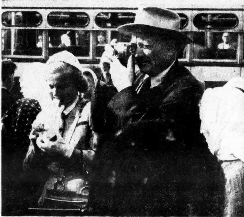
JUSTICE AND MRS. DOUGLAS SIGHT-SEEING IN MOSCOW IN '55 This photo was taken outside the St. Louis Catholic Cathedral

remnants from the geological destruction of the northernmost chain of the Tien Shan system. The road from the airport to the city—once the caravan route from Byzantium to China—runs through rich green countryside, intersected by swiftly flowing rivers coming down from the