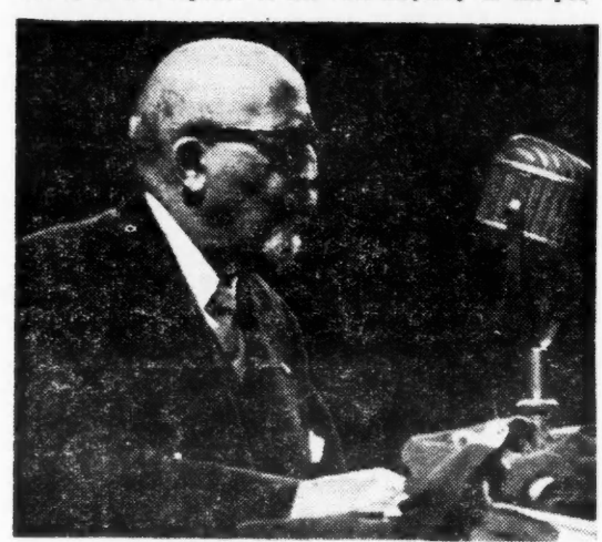
DR. W. E. B. DUBOIS

This pattern of behavior was not, of course, peculiar to the American scene. It was the world pattern of colonialism, in which a few white Western Europeans (same type) secured power and privilege for themselves at the expense of the vast majority of the peo-