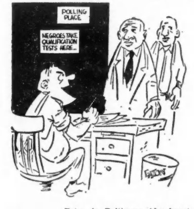
Eaton in Baltimore Afro-American "How many bubbles in a bar of soap?"

In protest against the gerrymandering, Negroes refused to buy from the white