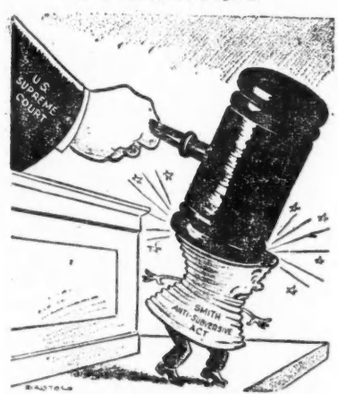
FROM THE BENCH