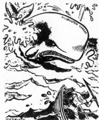
"THAR SHE BLOWS"

failure of the bill's backers to acknowledge and defend Part III opened the way the South's greatest coup. Sen. Richard B. Russell (D-Ga.), the rebels' biggest gun, looked up the amended section of existing law and found it to be part of an old Reconstruction Era statute pro-tecting every "right or privilege of a cit-izen of the United States." He further found that Section 1985 automatically invoked Section 1993 of the same statute, which provides: