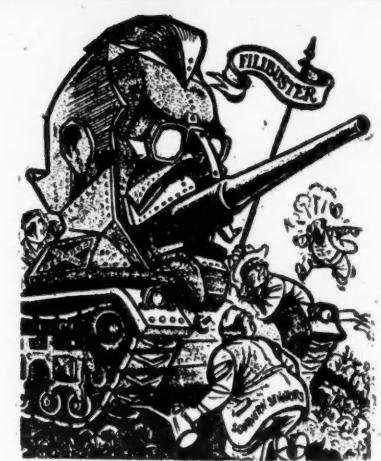
"Civil Rights a comin'

dants were associated with the magazine. The government maintains that they published false statements about the U.S. Federal Judge Louis E. Goodman gave the defense until Sept. 1 to get from China the names of all the witnesses and statements as to their willingness to testify; the lawyers were told to outline what the witnesses would testify to The what the witnesses would testify to. The defense foresaw considerable difficulty in obtaining the information, since their lawyer has been refused a passport to go to China.