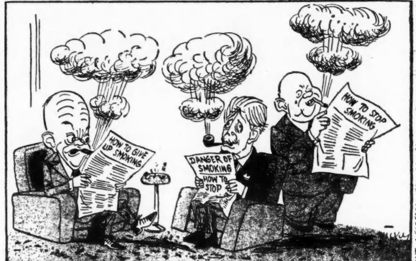
"Any of you really serious about giving it up?"

Against Nuclear Weapons, these 25 men and five women had come to protest as a "civil disobedience team" and to rouse the American public to the question whether tests should be supported even tacitly. The day before the latest device was exploded, 11 of them were arrested as they talked to the guards and entered the gates of the Atomic Energy Commission's proving grounds at Mercury, Nev. They were later released with sus-pended sentences,