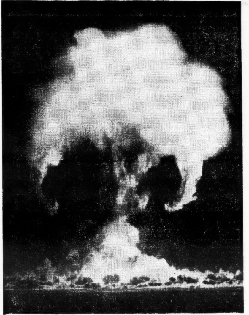
EVERY DAY, IN EVERY WAY, THEY'RE GROWING BIGGER AND BIGGER recent blast in Nevada made the Hiroshima bomb look like a cap pistol