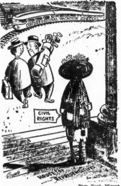
Next election she'll be a big girl

THURMOND'S LAST STAND: The great civil rights debate, though it lasted long