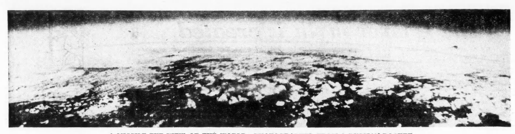
A MISSILE-EYE VIEW OF THE WORLD—PHOTOGRAPHED FROM A RUSSIAN ROCKET The tiny blots are clouds. The horizon curves when seen from space.