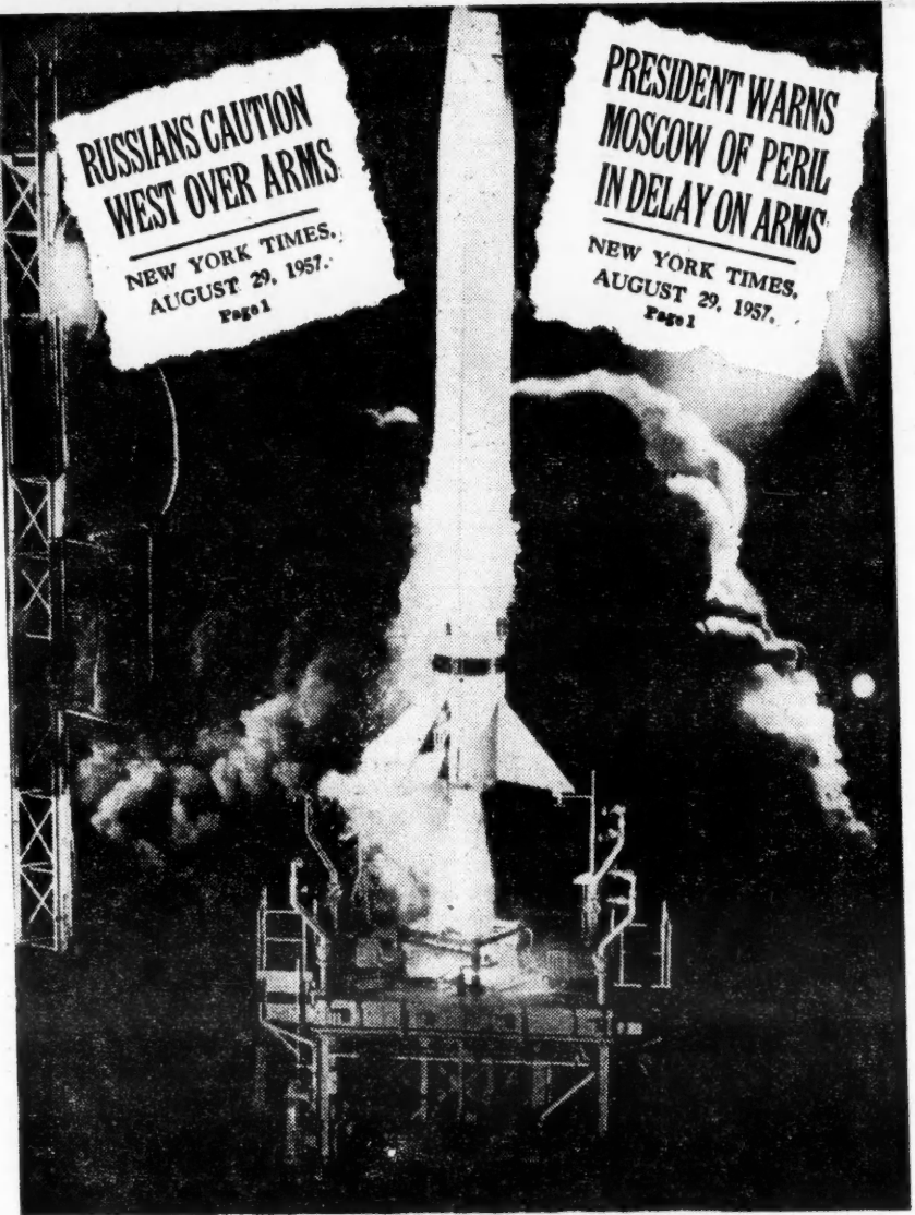
WILL THOSE WHO WARN ALSO HEED? "The rocket's red glare . . . " at a U.S. missile test