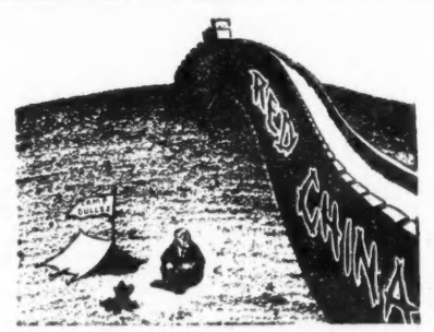
Fitzpatrick in St. Louis Post-Dispatch "It may fall down—sometime"

Everywhere—mostly of plain design, but beautiful just by being there—are new department stores, hospitals, librarles, hotels, office and apartment build-