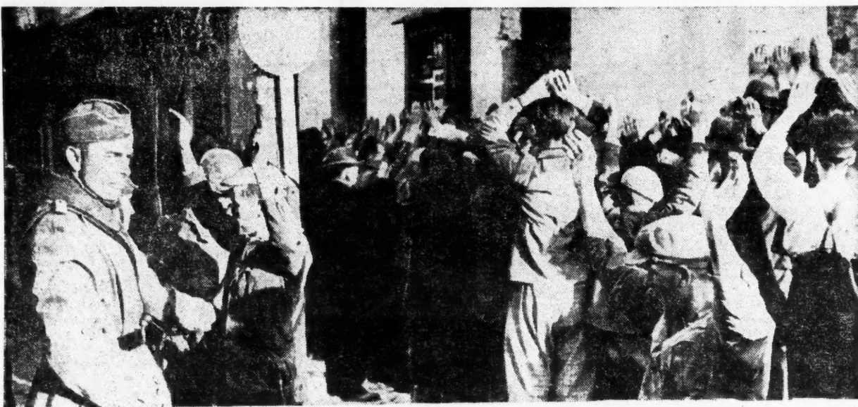
THIS IS THE MAIN REASON WHY THERE ARE SO FEW JEWS IN POLAND NOW A Gestapo raid on the Warsaw Ghetto—prelude to dcath in the gas chamber