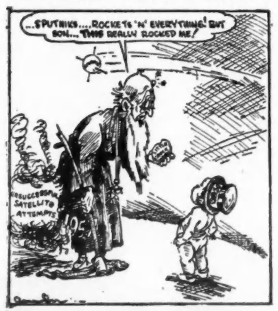
BETTER LUCK, 1958

Some of these are run-away plants from the North attracted by tax and other concessions and the Dixie boast of "cooperative" and "loyal" labor. But new industries are settling in the South, too. The chemical, synthetic fibers and electronics industries are expanding rapidly. General Electric has opened 19 new major plants in the South in the past decade. Atomic energy installations, air-