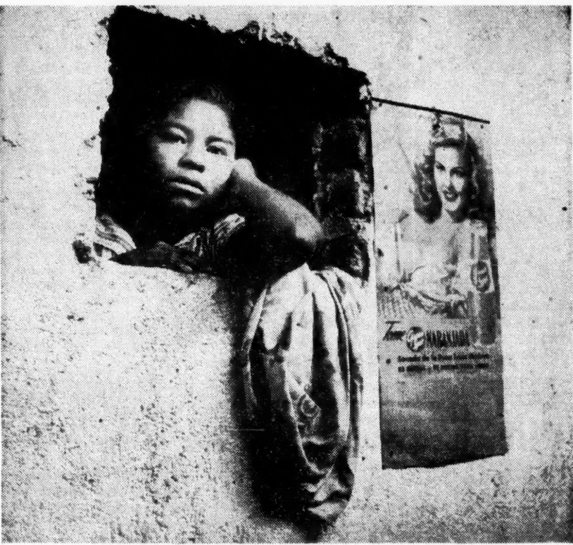
VENEZUELA: MAGNIFICENT SKYSCRAPERS AND STARVING COUNTRYSIDE The prosperity from the oil wells does not go to the people

DEMOCRACY CRUSHED: Swiftly Accion Democratica was outlawed along with all other serious opposition. A concentration camp on a fever-ridden island in the Guasano river was set up to accommodate trade union leaders and others. The tales of torture from Guasano moved even AFL leaders to protest. In 1951 the oil workers went on strike. This is the way Mat-thew Woll for the AFL and Jacob Potof-