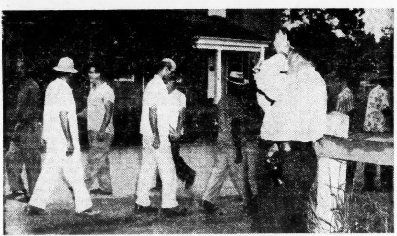
COPS TAKE PICTURES OF PICKETS IN LOUISIANA STRIKE