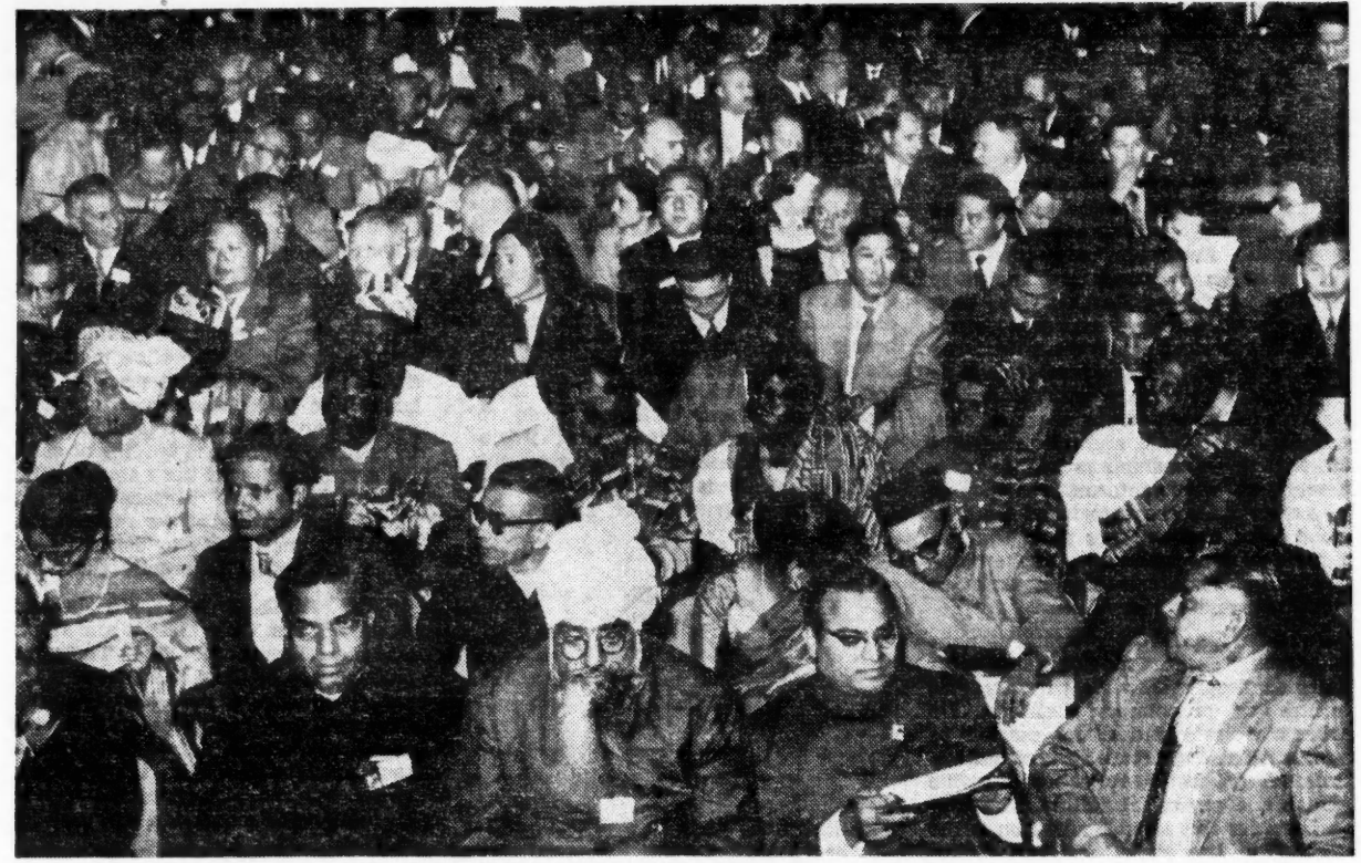
GENERAL SCENE AT THE AFRO-ASIAN CONFERENCE IN CAIRO: INDIAN DELEGATES IN FRONT ROW

ians' unity against Western imperialism and warmongering spread alarm in Washington. Secy. of State Dulles announced he would attend the Baghdad Pact conference this month in Ankara with power "to match or top the Russian economic carrot" (N. Y. Herald Tribune). But Egyptian papers from right to left echoed conference delegates' insistence that the Baghdad and SEATO pacts, like NATO, were aggressive and by now moribund. Dulles' presence at Ankara could only make U.S. control of its pact puppets more obvious and deepen Middle Eastern disgust. Egypt's Anwar El Sadat won banner headlines and delegates' cheers when he said decisions for peace or war could no longer be made in "certain European capitals": the Afro-Asian two-thirds of mankind could combine to "make war impossible."