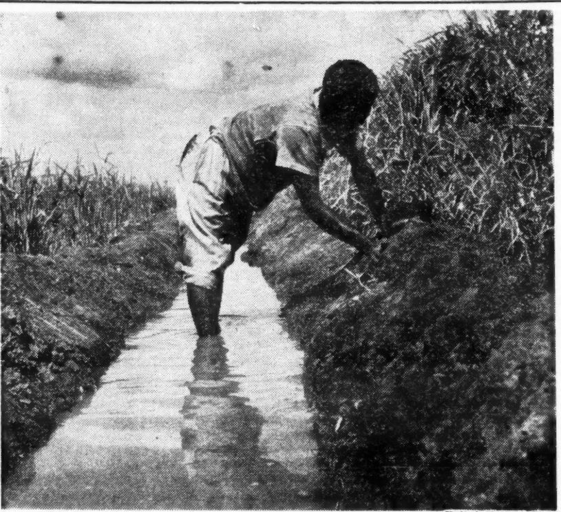
IN JAMAICA: THE BENT BACK, THE STRUGGLE FOR A LIVING A worker builds up an irrigation canal alongside a rice paddy

Strung like sparkling beads across a thousand miles of emerald sea, the islands of Jamaica, Trinidad, Barbados, Tobago, the Leewards and the Windwards will comprise the federation. Their sugarum-molasses economy has recently been bolstered by the development of American- and British-owned oil, asphalt and bauxite. But the people have remained so poor that they migrate in droves to Britain and the U.S. as low-paid workers even though many islands remain under-populated.