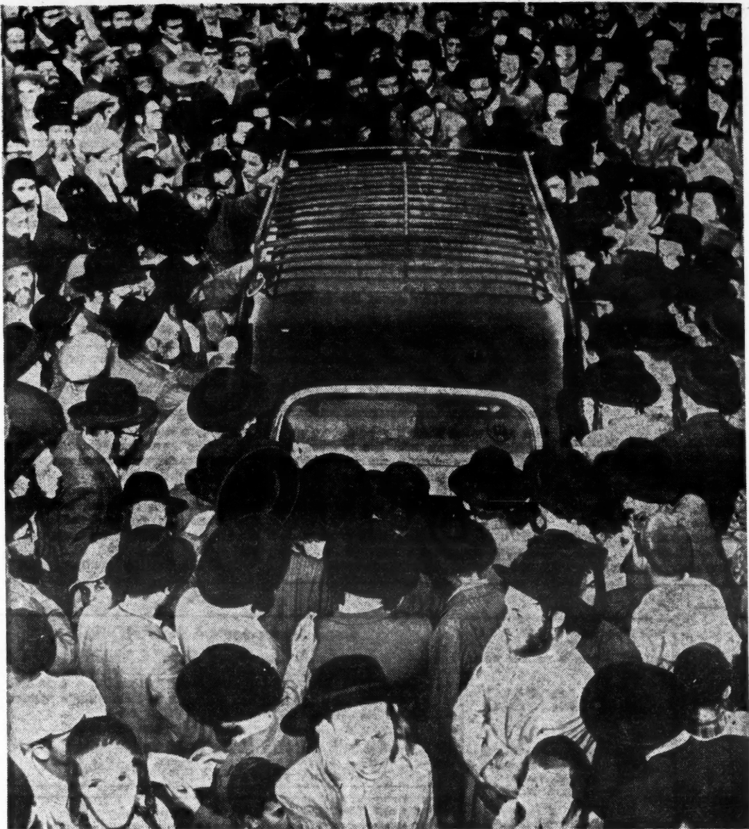
ORTHODOX JEWS STAGE A DEMONSTRATION AGAINST MIXED BATHING IN JERUSALEM Opening of a public swimming pool was considered a desecration of the city. The "struggle to avoid struggle" on the religious question is a foremost issue in Israel today.