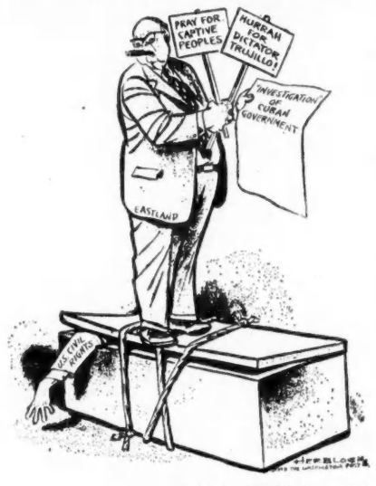
Herblock, Washington Post "Quiet! I'm busy"