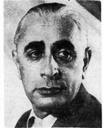
PINHAS LAVON 'The workers have not deserted me'

COSTLY VICTORY: Thus while the fight continues, both within Mapai and the labor movement as a whole, the country is without a government. Most parties today are opposed to entering a new coalition under Ben-Gurion, and several former Mapai ministers, includ-ing Foreign Minister Golda Meir and