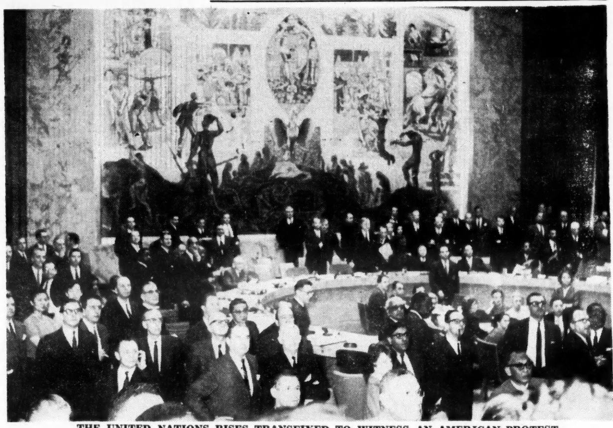
THE UNITED NATIONS RISES TRANSFIXED TO WITNESS AN AMERICAN PROTEST area (see photo, p. 8) there was sorrou