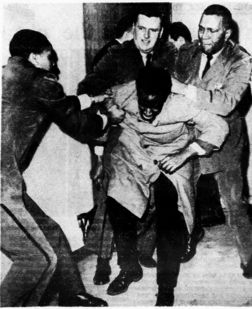
A DEMONSTRATOR GETS A ROUGH ESCORT OUT OF THE UN CHAMBER A suddenly color-blind State Dept. could see only Kremlin inspiration

"And with the Congo crisis the U.S. began to repeat the most absurd and elementary error previously made in Asia and the Middle East: simplistic division of African governments and statesmen