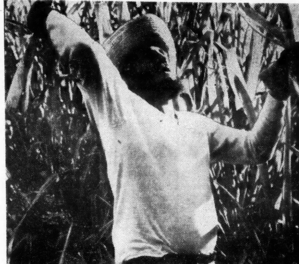
CASTRO SETS AN EXAMPLE FOR VOLUNTEERS No one is surprised to see him cutting sugar cane

MYTHS PUNCTURED: In the mill, the ancient but still serviceable machinery dragged tons of cane up into its maw, pulverized and processed it, and spewed forth a mountain of sugar almost reaching the roof of the storage