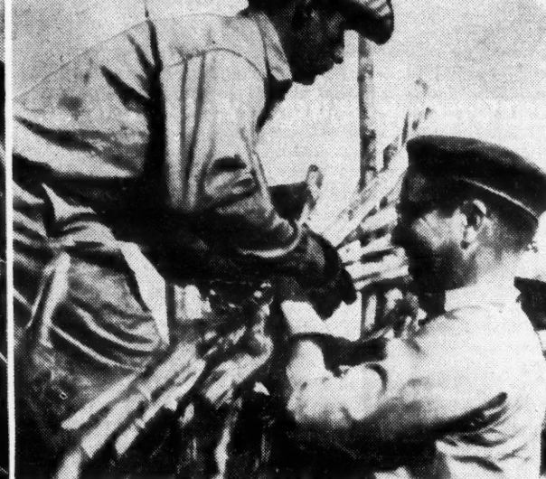
PRESIDENT DORTICOS HELPS LOAD CUT CANE Volunteer brigades accomplished more than regular workers

nationalization the mill is both more efficient and more economical; the workers know what bumper production means to every Cuban and they take loving care of their own machinery.