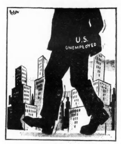
The giant of Wall Street

In 1959 as a Senator, Kennedy was the author of S-1046 to provide a $1.25 min-imum wage immediately and cover 8 million more workers. The watered-down Kennedy proposal of 1961 accepts most of the compromises forced by business opponents of wage-hour improvements during the last Congress. Powell objected to this approach by President Kennedy and said "legislation should be introduced at the maximum." This would insure that compromises do not cut too deep, and that