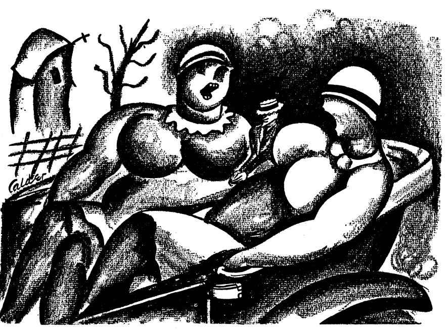
DRAWING BY SANDY CALDER

The May issue, which was barred by the Post Office after it had been mailed third class to our subscribers, sold out on the newsstands within a few days after its appearance. The decision of the department now makes it impossible for us to mail any further copies of the May issue. The June issue went through the mails third class. It has not been declared unmailable. This, the July issue will be reviewed by the Post Office department in connection with renewed application for second class mailing privileges.