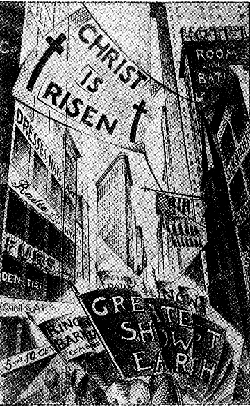
DRAWING BY A. RONNEBECK

Watch the radical press for an announcement of the place and time.