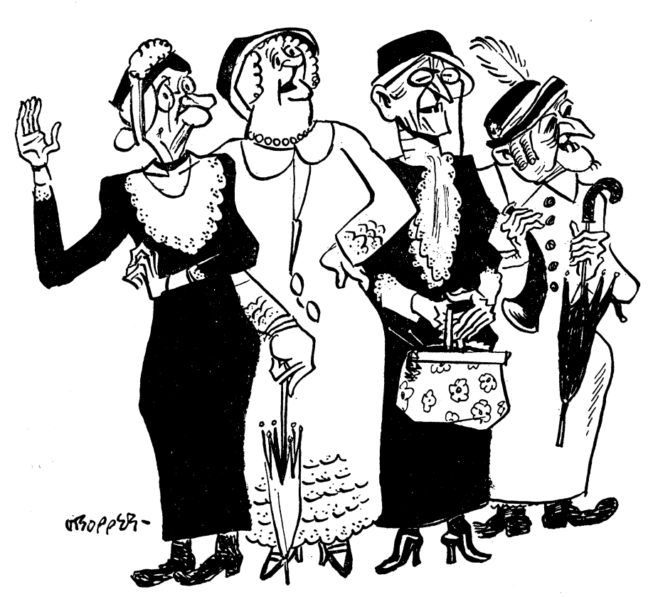
DRAWING BY WILLIAM GROPPER

Our business department alleges that this cooperative enterprise of ours is threatened with success. Nonsense. Our business department makes us nervous. "Success" is the great American bore. And with your help (see our house ad) we'd like to continue as un-American and as interesting as possible.