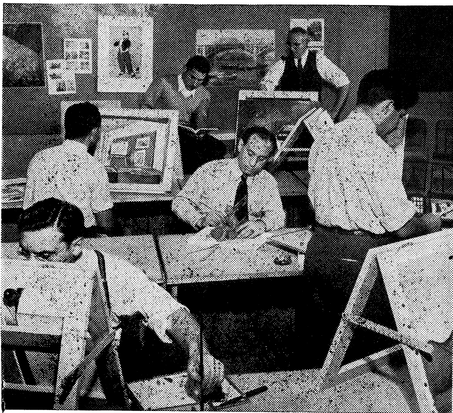
Class in painting and sculpture at War Veterans Art Center, recently established at the Museum of Modern Art to help bring about, through the arts, the readjustment of the veteran to civilian life. Any veteran may join the Center. Instruction and materials are free, or of nominal cost. Classes are held in drawing, painting, jewelry, metalwork, sculpture, ceramics, design, woodworking, wood engraving, book illustration, graphic arts, silk screen printing, lettering, layout and typography. Work done by the veterans is on exhibition at the Museum through November 25.

what he calls Student-Faculty Reaction Sheets . The reaction sheets call for rating by the students on the teacher's attitude toward them, presentation of subject matter, stimulation of interest, etc. Specific examples of questions asked are: (1) Does he (or she) stick closely to the subject matter of the course? (2) Does he encourage the students to ask questions? (3) Does he welcome class discussion and allow students to voice their opinions?