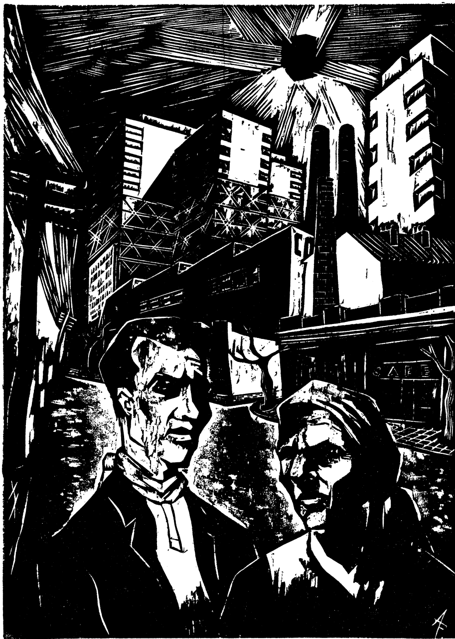
Woodcut by Antonio Frasconi.

not 100 percent effective, that it does not apply to "the special few." The fact is that all personality , sick or healthy, is very complex and must be so because it is a reflection of our very complex society. Consequently, there are no simple psychiatric problems . It should also be obvious that people do not need to take simple problems to a psychiatrist.