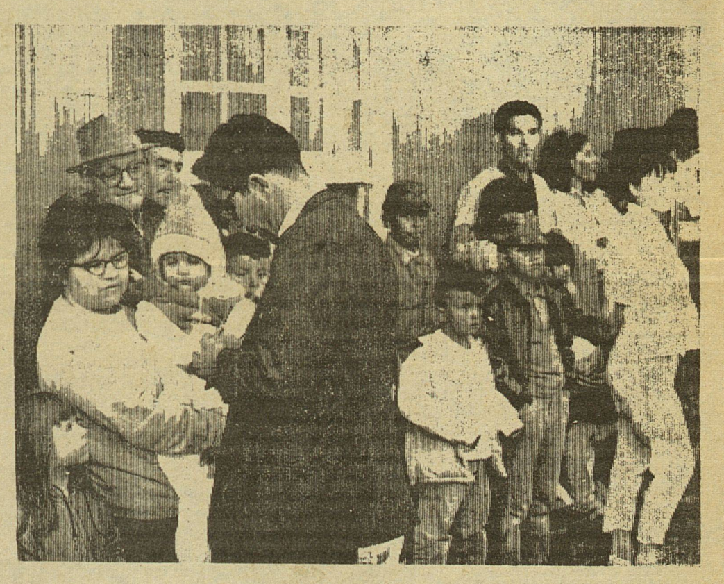
Alianza members just before they were taken to Santa Fe jail

manifestation that you know you are right and you wish to tear down the system that enslaved you." He saw this as growing too in his own people—and the events of Tierra Amarilla as a maturing force in the process of "cleansing ourselves of fear and terror", of beginning to struggle "for our land, which was stolen by the