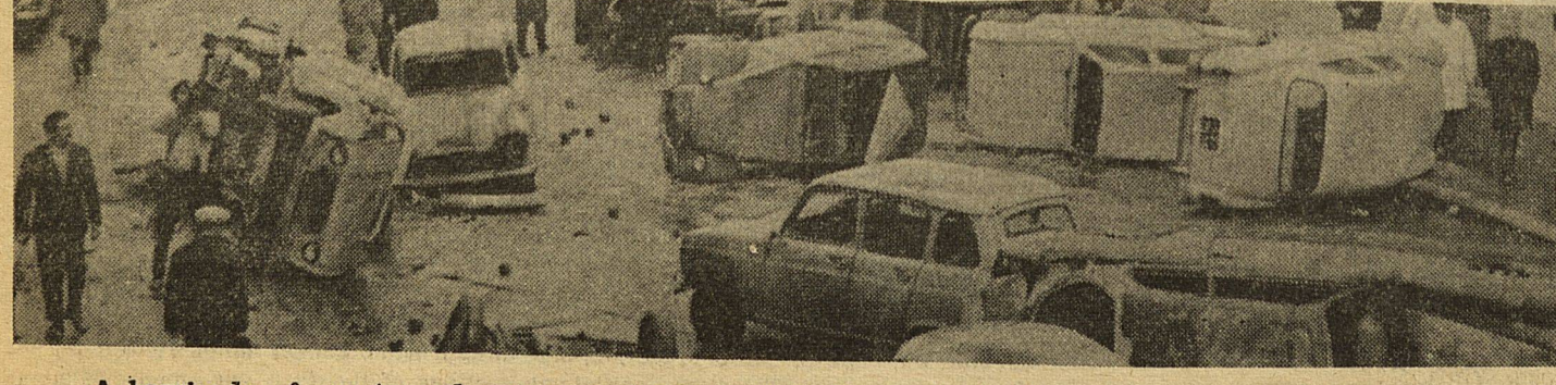
A barricade of overturned autos erected by students against the police chokes Rue Gay-Lussac.