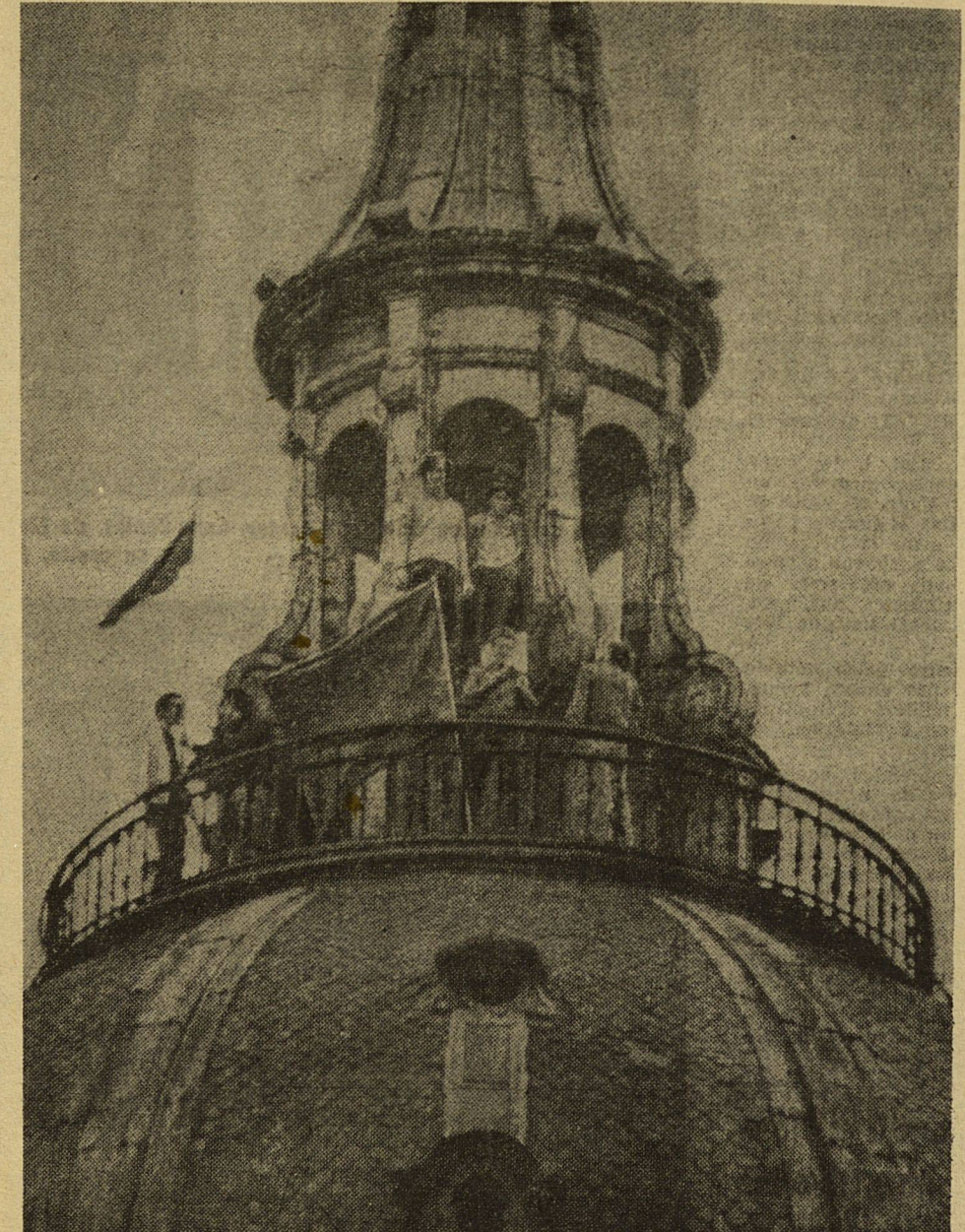
STUDENTS FLY RED FLAG OVER SORBONNE

But the question of "self-interest", or our class interest, has always been a red herring dragged across our path. Somehow, we always felt that that was a necessary byword of motivating people to act. But we always remained ambivalent about what it meant-there was narrow and broad self-interest, and often the two were used interchangeably. Self-interest became tied to security by the ruling class. Insecurity has always been one of the most important factors in forcing people in a capitalist system to produce, and thus achieve materialist gains. By constantly emphasizing insecurity, and providing material gains as a method of alleviating the problem (say, through advertising) the capitalist economy could maintain consumption at a high level. So, in the narrow definition, self-interest dictated to students that they finish school and thus be able to acquire more material possessions. For whites who could not achieve an adequate identity through the purchase of material goods, there was a racism which said: "At least I am not black." That has provided another method of reducing insecurity and establishing identity within capitalismand thus racism was also useful to the