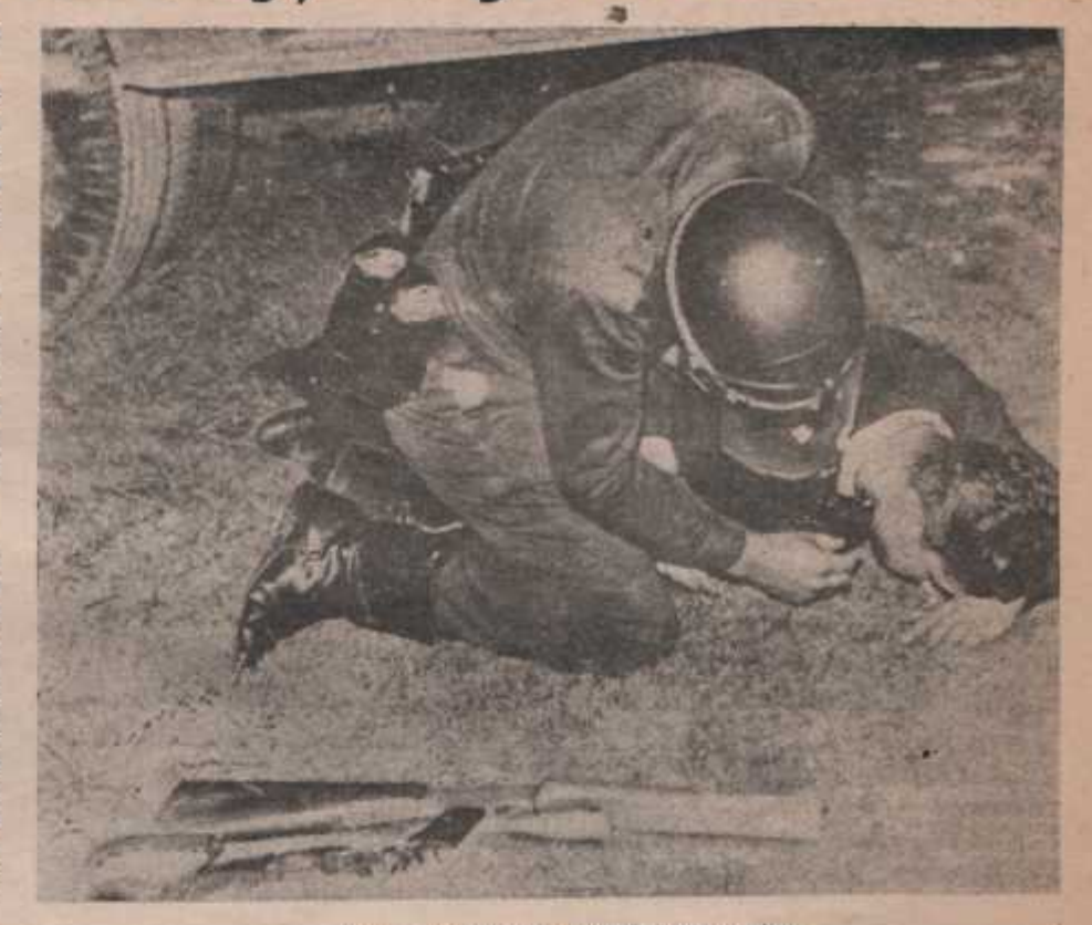
A soldier aids his wounded companion.

It is reported that hundreds have been wounded in that battle. The Army has reported that no students have been killed and has burned more than fifty