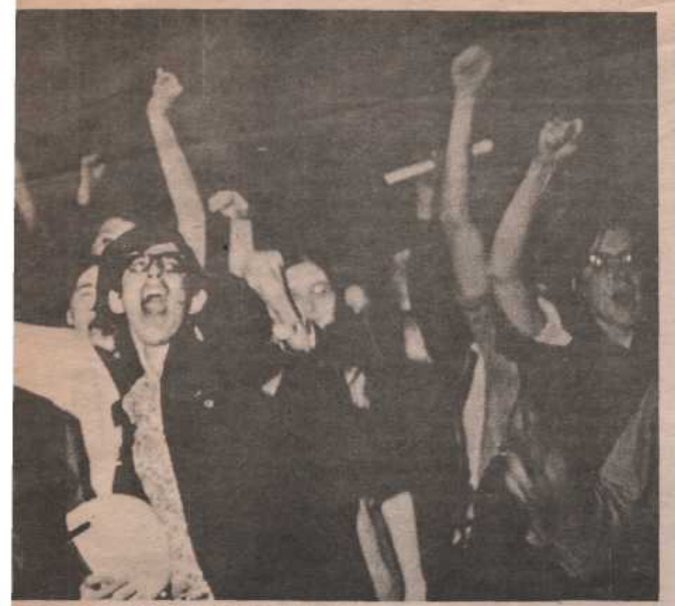
ordier, assassin for the CIA," chant Columbia students.