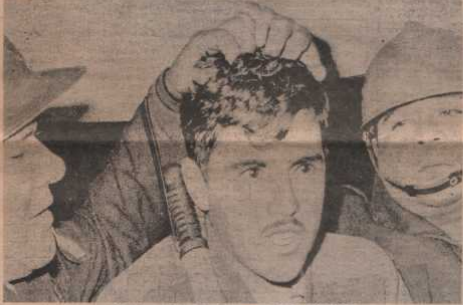
Mexican police display one of their prisoners.

Finally, the action in Chicago has shown that we must use the streets (continued on Page 6)