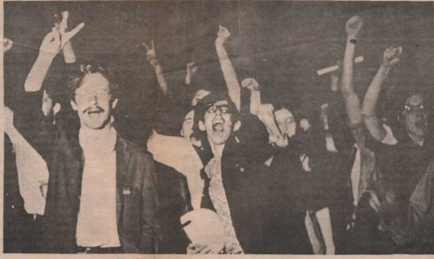
"Hey, hey, Cordier, assassin for the CIA," chant Columbia students.

(This is an excerpt from "Columbia Liberated", a pamphlet recently published by the Columbia Strike Co-ordinating Committee. The pamphlet is available from the Committee for 50¢ a copy (10¢ a copy in chapter bulk orders). Write to SDS, Box 238, Cathedral Station, New York, New York 10025.)