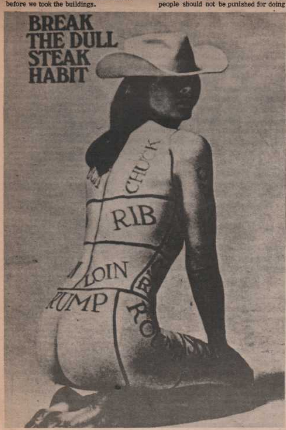
Miss America? See roundup on page 5 for the story of this year's pageant.

NOO JOISEY, NEW REGION: Regional conference of New Jersey so's will be the weekend of October 4-5 at Princeton. For information, write to Princeton SDS, 48 University Pl., P'ton, N.J. 08540 mano