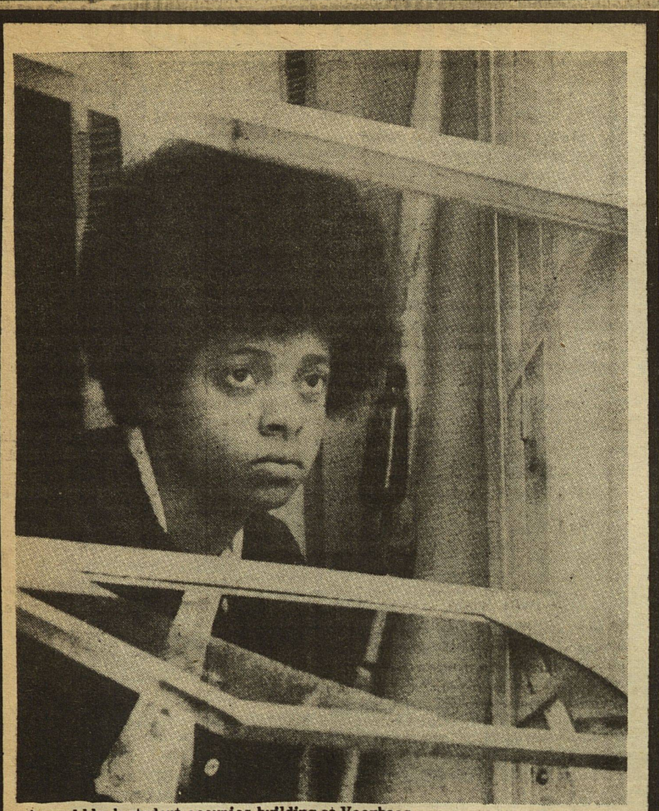
Armed black student occupies building at Voorhees.

VOORHEES COLLEGE, DENMARK, S.C.: Armed black students seized two buildings here last week with 11 demands, including a black studies program and placing blacks in charge of each academic department. They also demanded passing grades for all students who had flunked a course under a white professor. They were arrested Wednesday after 200 National Guardsmen stormed the campus. They have been charged with riot and unlawful assembly and taken to the state penitentiary in Columbia for arraignment.