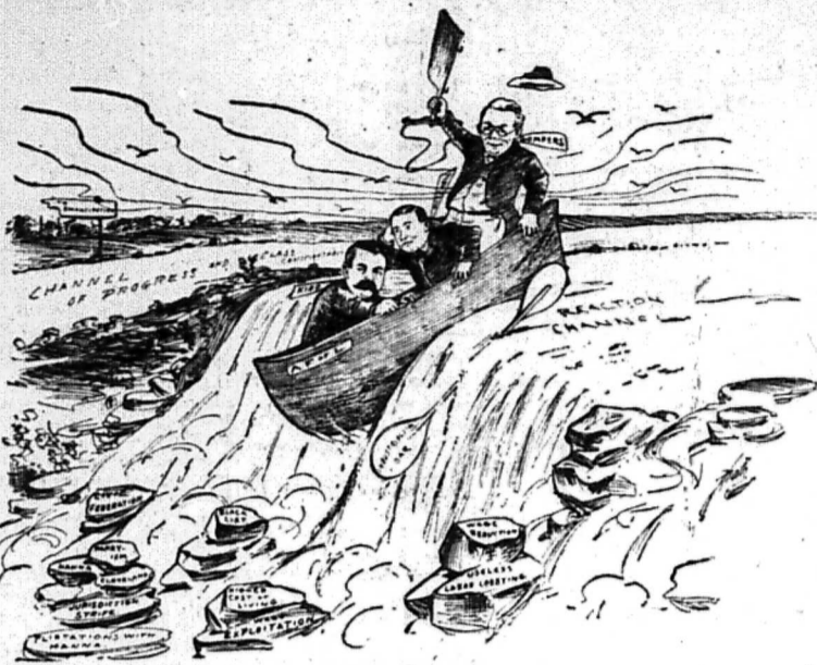
The Men in Control of the American Federation of Labor Have Decided to Sail a Rocky Course, Just to Spite the Socialists!