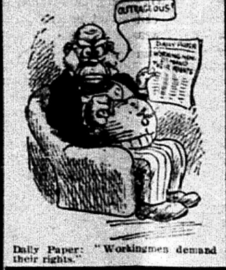
Daily Paper: "Workmen demand their rights."