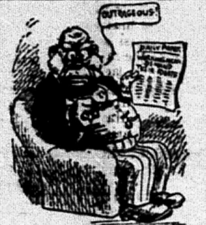
Capitalist: "Workmen demand their rights. Outrageous! I'll get an injunction!"

District Board No. 10 of the International Association of Machine Meets 1st Saturday every month at