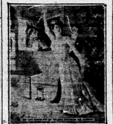
"A Race for Life."