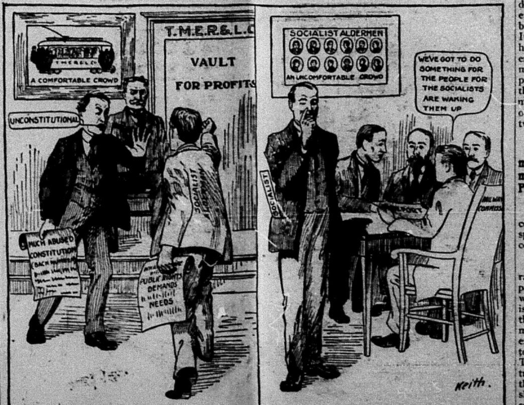
PAST and PRESENT or How the Powers Came to Get Busy!

We put an individuality into your printing that demands attention. Let us show you samples. The Co-operative Printery, 344 Sixth street.