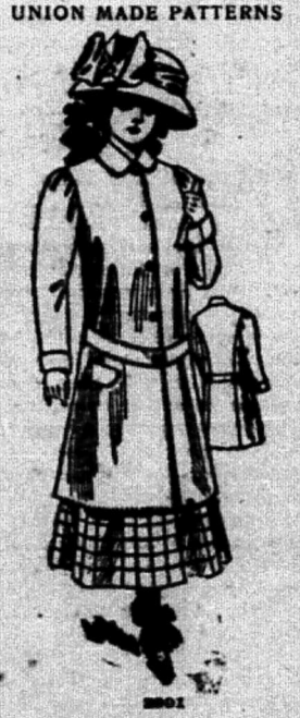
MINISTERS' SEMI-FITTING COATS Paris Pattern No. 1901 All Seams Allowed.

An "Americanized" Adaptation of Robert Blatchford's Famous "Merrie England" CHAPTER XII. WHAT ARE WE TO DO? THE question is, how can Socialism be accomplished? I confess that I approach this question with great reluctance. The establishment and organization of a Socialistic state are the two branches of the work to which I have given least attention.