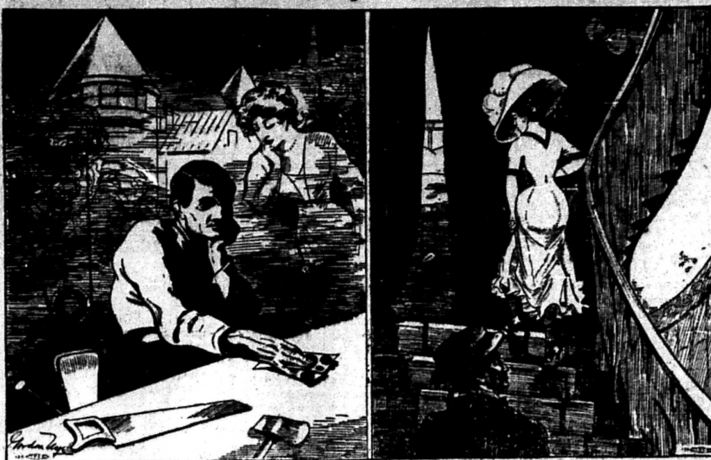
The Dream of Home But Capitalism Gives This Instead