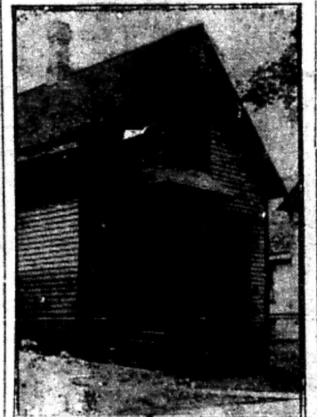
Soak the Little Ones! A home at 1267 Sixth street, that is over-assessed.

have been raised to $1,730! Soak the little fellow! Take the mansion of Mrs. Berthe