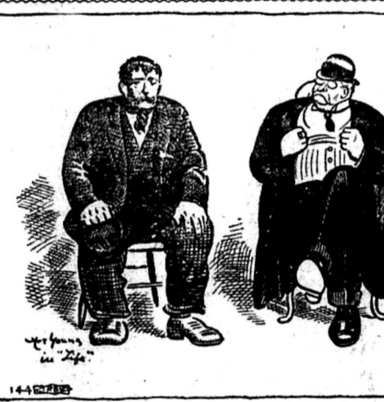
Contractor—Why, confound it! I risk my capital! You don't risk anything. Worker on Bridges and Buildings—That's right; all I risk is my life.