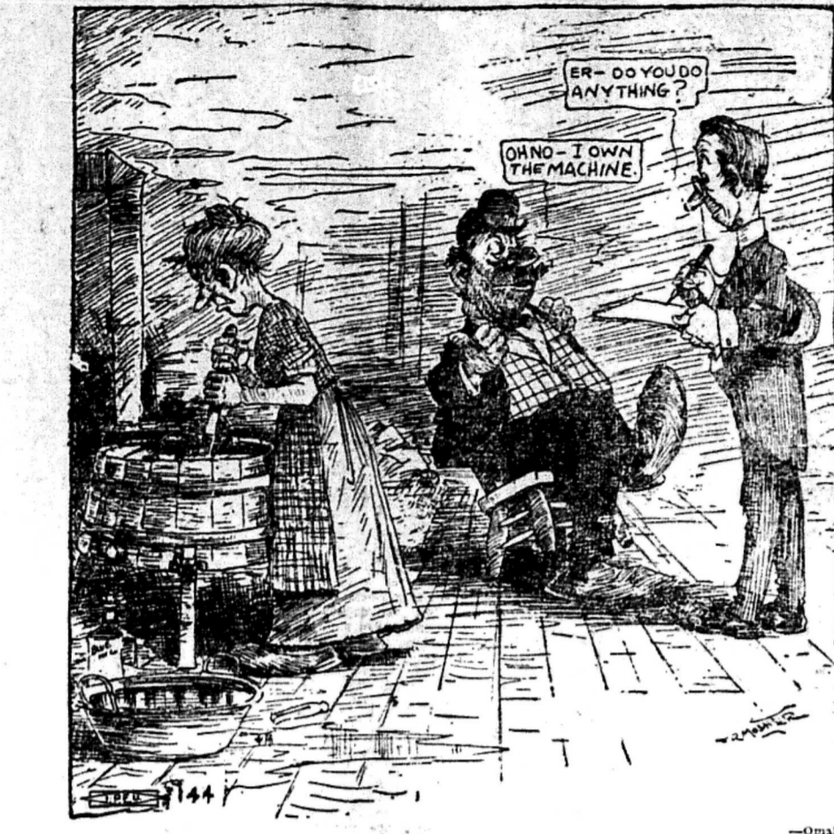
Who Owns My Job Owns Me