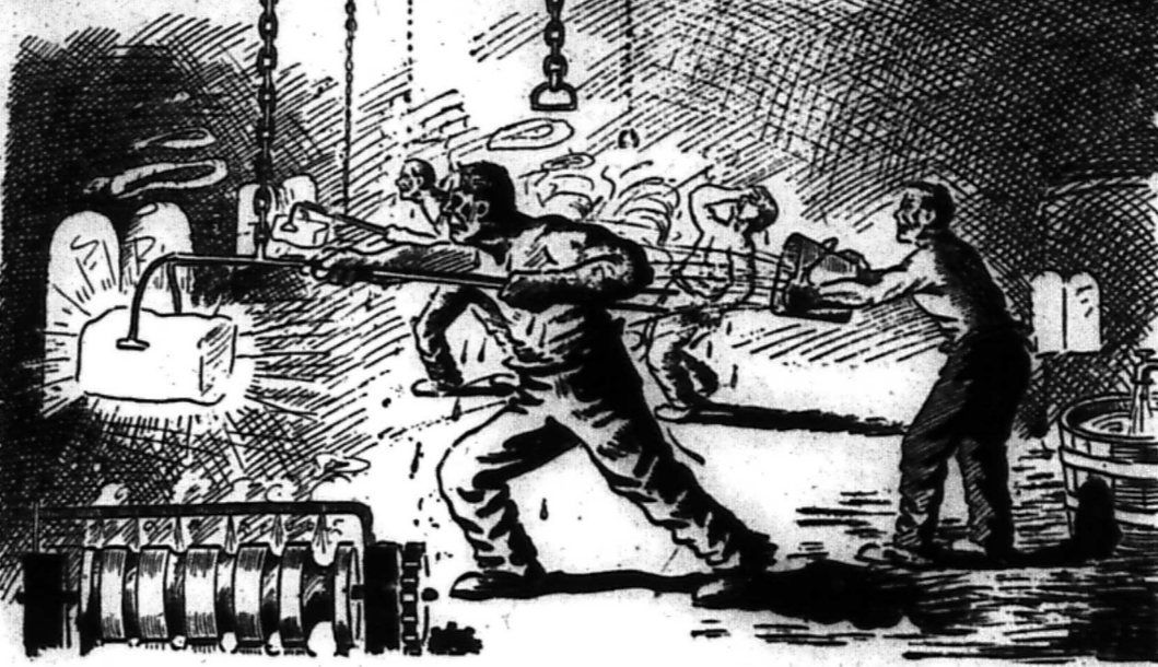
PITTSBURG, Jan. 9.—The officials of the United States Steel Corporation gave an elaborate dinner last night at the Fort Pitt Hotel, which cost $100 per plate. The hall was made into a beautiful summer garden.