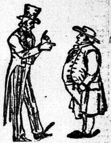
UNCLE SAM AND BROTHER JONATHAN.

It makes the observant student of industrial combinations in this country smile to note how the large trusts, like the Steel, Ship, Railroad and others, keep right on growing, while suits are being brought against the comparatively small ones, like the Glass Combine and the Kodak Trust, in an attempt to "bust the trust"; that is, prevent the growth of trustification. It makes such a student smile; it does, indeed!