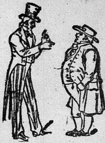
UNCLE SAM AND BROTHER JONATHAN.

If a Socialist Movement does not own its press, that press will own the Movement. Of all grotesque sights imaginable, can there be any more grotesque than that of a Movement that claims to be revolutionist allowing its most potent weapon to be wielded by private interests?