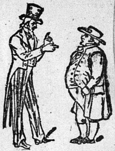
UNCLE SAM AND BROTHER JONA- THAN.

Watch the label on your paper. It will tell you when your subscription ex- pires. First number indicates the month, second, the day, third the year.