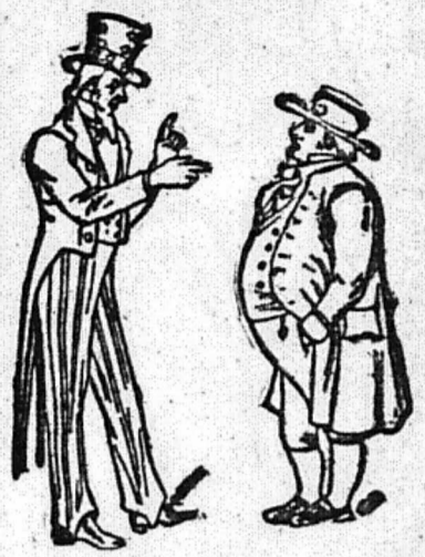
UNCLE SAM AND BROTHER JONATHAN.

Watch the label on your paper. It will tell you when your subscription expires. First number indicates the month, second, the day, third the year.