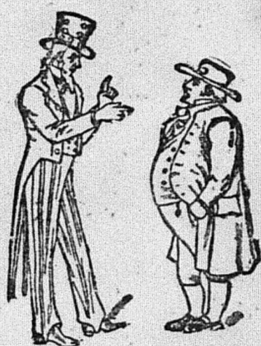
UNCLE SAM AND BROTHER JONATHAN.

New Orleans, August 6.—Commencing next Monday, the Lane-Magnin cotton mills of New Orleans will be run six days a week, instead of three, but there will be a twenty per cent. cut in wages.