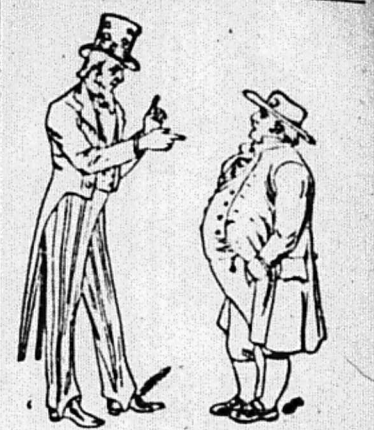
UNCLE SAM & BROTHER JONATHAN.