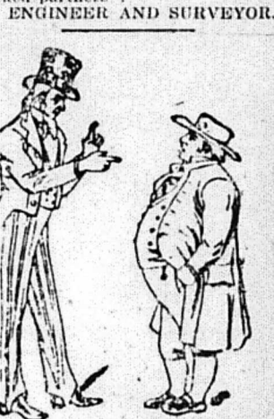
SMILEY & BROTHERS' NATURAL

It might also be well to ask the Debs-Hinton trust how much commission they will get out of this $875,000 profit which is to be paid on this land. Or is this one more instance in which the Debs "Social Democracy," being caught in crookedness, the people are to be told that Debs is a saint, but in the hands of "wicked partners?"