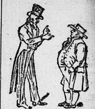
UNCLE SAM & BROTHER JONATHAN.

Scatter ashes on thy head, Tears of burning sorrow shed, Earth! and be by Pity led To Love's fold; Ere they block the very door With lean corpses of the poor, And will hush for naught but gore, Hunger and Cold!