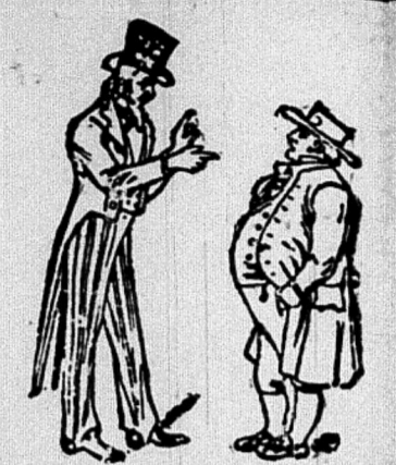
Uncle Sam & Brother Jonathan

Then, friends, all to the rescue! His power you can resist, Else he will overwhelm us, The Dread Monopolist.