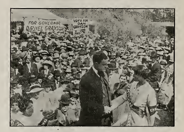
A SCENE IN "FROM DUSK TO DAWN"

Socialist propagandists who have seen the maze of people flocking to the nickle picture pantomime shows and who have later gone into sparsely peopled halls to deliver the message of Socialism have asked me for the answer to the situation. I think I have found it. My purpose is to do two things. First I want to take the Socialist propaganda into the motion picture show and second I want to take the motion picture show into Socialist meeting halls. In this latter attempt there is