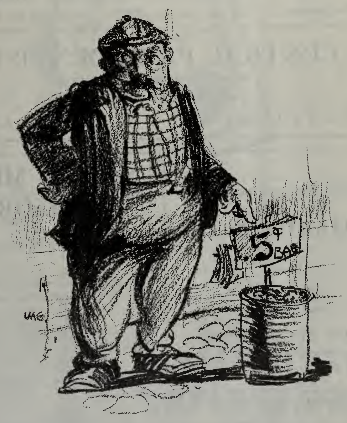
"Job? Huh! Me no working man; me business man"