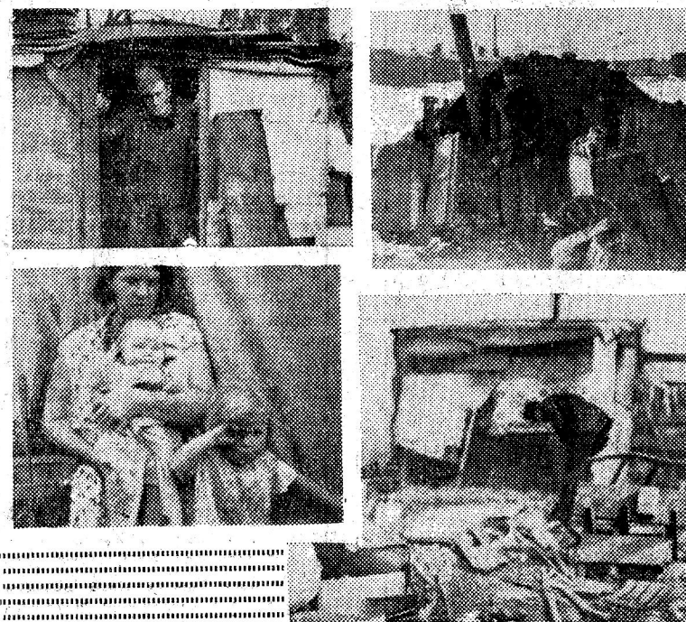
Upper left, a lumberjack in his home in Hooverville outside Eugene, Oregon. Lower left, Woman worker with baby born in tent in Hooverville. Upper right, Unemployed miner finds refuge from snows of Butte, Montana, in old oven. Lower right, Ex-soldier and home he has built on Frisco dumps from linoleum, tin cans, and other refuse to house his wife, just out of hospital.

San Jose gives us news that they will do their share in the Anti-