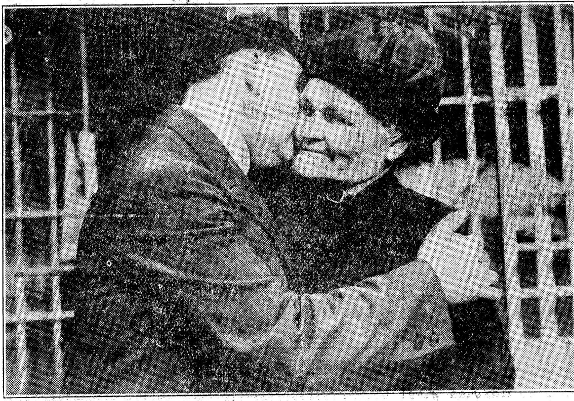
This photo of Tom Mooney bidding his Mother good-bye as he departs for the Death House at San Quentin 15 years ago, is exclusive to the Western Worker. The militant working-class mother is now touring the United States under the auspices of the International Labor Defense to rally the workers to demand the immediate and unconditional release of Tom Mooney.