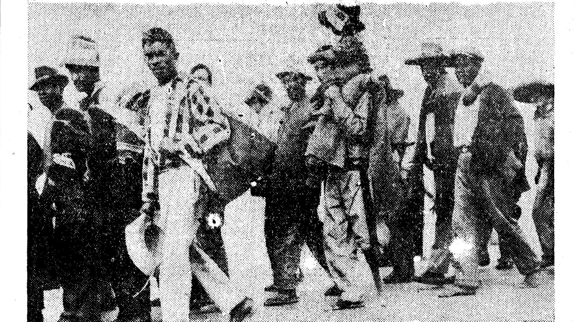
This picture shows part of the thousands of militant Mexican workers and peasants on their way to Mexico City to demand Unemployment Insurance paid by the rich landlords and industrial servants of Wall Street.