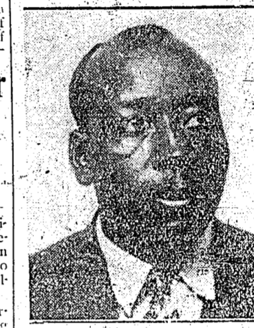
Communist Party Candidate for Lieutenant-Governor