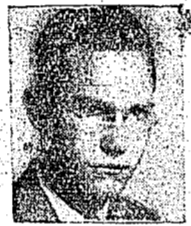
Communist Candidate for Assemblyman, 69th District

few of the more crafty sometimes got the "hang" of the racket and actually "made their grade" and became bloated plutocrats living off the work of others. This was known as "success."