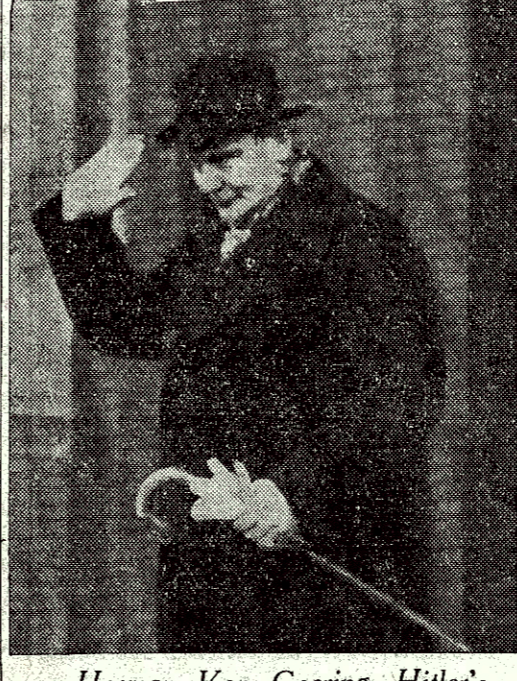
Herman Von Goering, Hitler's number one boy who designed the fascist program of aggression which includes invasion of the Soviet Union and seizure of the smaller nations of Europe.