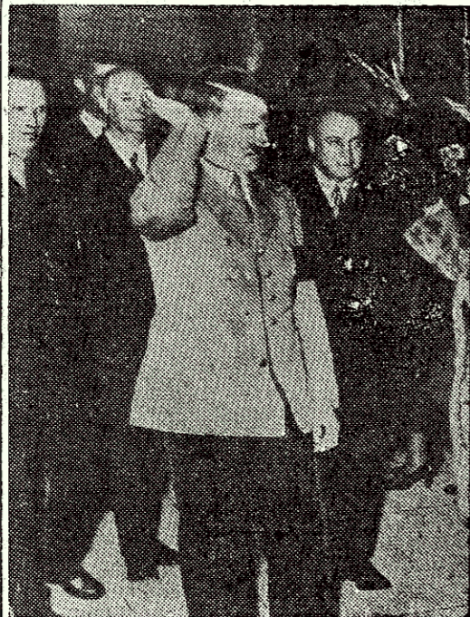
Hitler's move to seize the free city of Danzig was timed perfectly to put pressure on the League of Nations in session at Geneva.