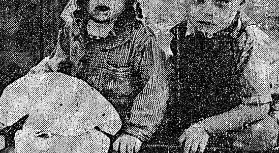
CHILDREN OF transients in San Joaquin Valley. Their parents, lured here by ads for cheap agricultural labor, are starving to death.