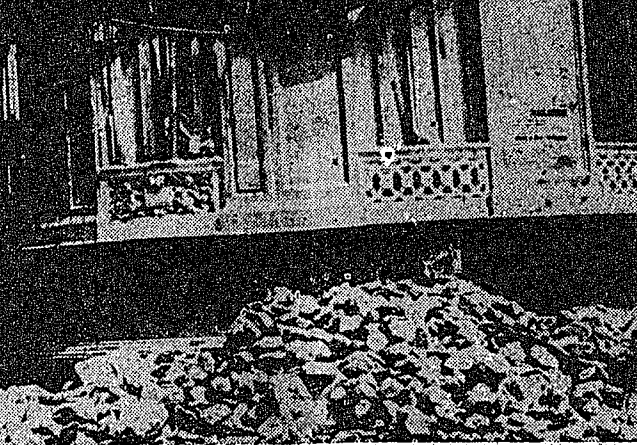
THE WRECKED Bank of Spain in Almeria, one of the many public buildings destroyed during shelling of the city by Nazi warships recently.