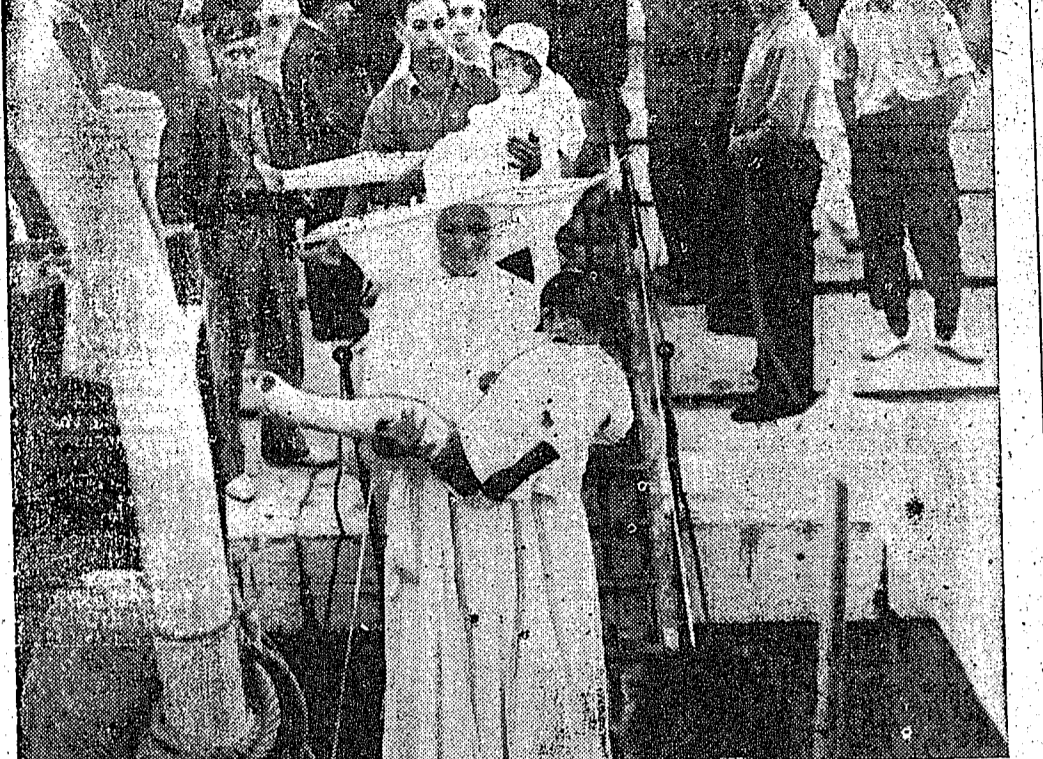
Basque children, wounded in Nazi and Italian air raids, are carried to a relief station by a nun, a nurse and an aide.