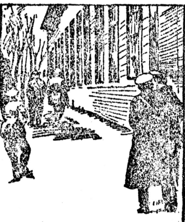
Policemen chasing the newsboys selling Pravda in 1912. During the Mail Order House Drive in Chicago the bosses and their gangsters attempted to drive away the Young Workers newsies.

masters of the government of the United States are the combined capitalists and manufacturers of the United States . . ." (p. 57). And when Wilson became the head of the government, he became the leading executive for the "combined capitalists and manufacturers of the United States."