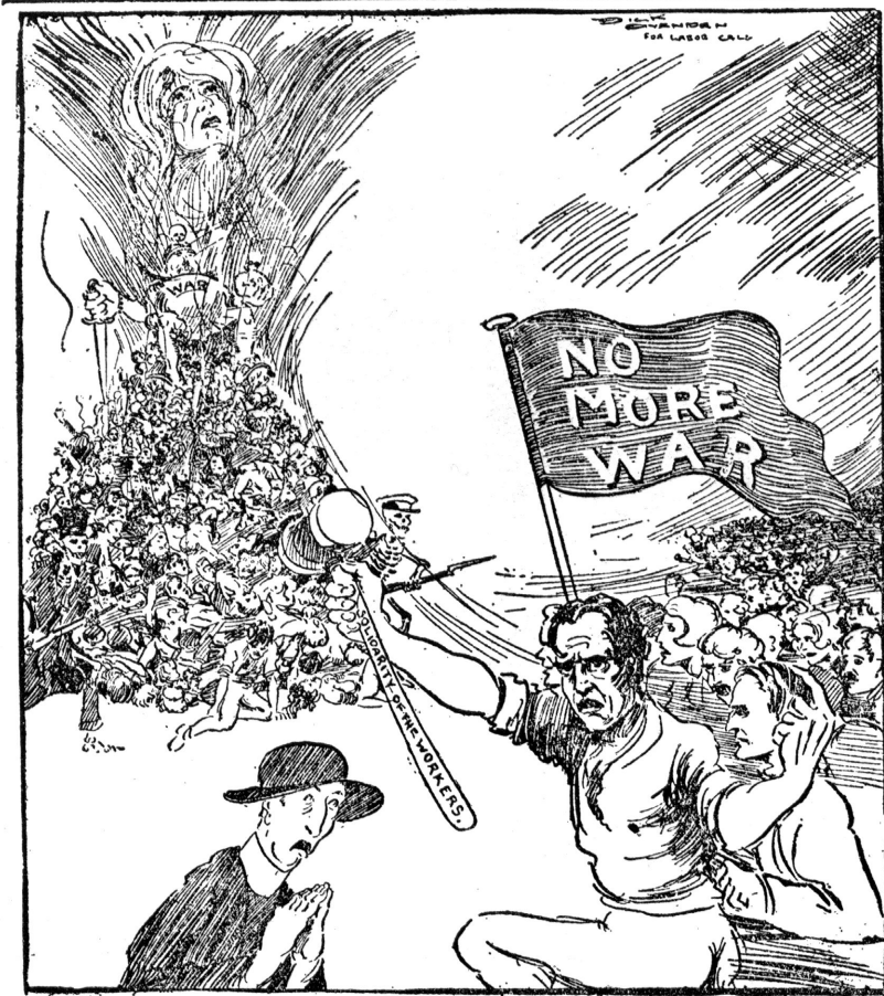
Dick Ovenden in "Labor Call" (MELBOURNE, AUSTRALIA)