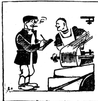
Young Worker Correspondent