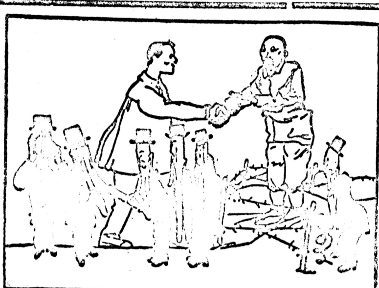
When the Soviet Union approaches the National Revolutionary Movement of China the bourgeoisie makes long faces.

For a Class Organ Thru Worker Correspondents