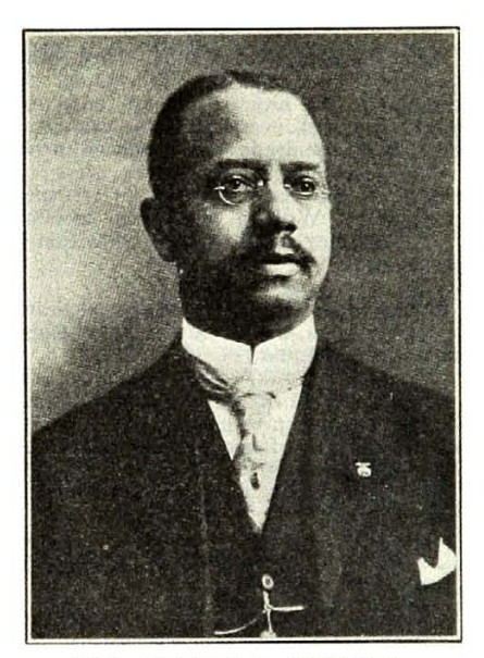
HON. CHARLES A. COTTRELL Collector of the Port of Honolulu

President Taft has appointed Charles A. Cottrell, colored, to be Collector of the Port at Honolulu, but is embarrassed in his in-