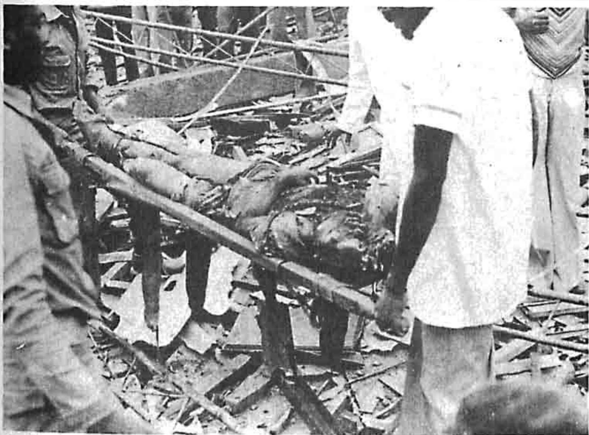
An Angolan victim of one of the attacks by the Pretoria regime.

Yet the peoples of Africa know only too well that the suffering and retrogression they have experienced has been inflicted on them by the counter-revolutionary formula imposed on