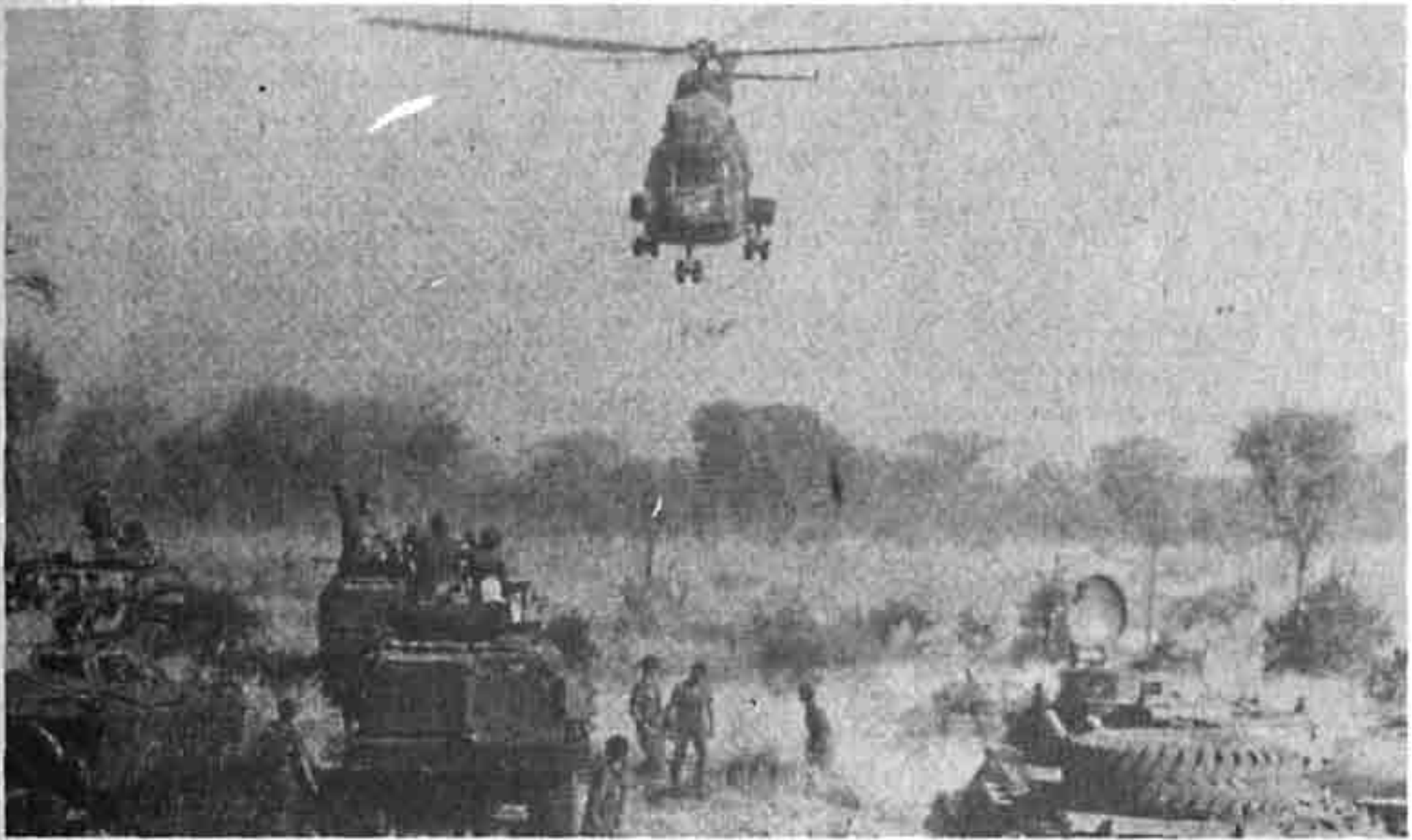
Aggression and destabilisation: the army of the Pretoria regime.

Under the umbrella of Reagan's policy of "constructive engagement" South Africa has been encouraged to regard itself as a regional power in Africa in the same way as Israel in the Middle East, with the same disastrous consequences. Charging that it is being subjected to a "total onslaught" by "Russian imperialism" and "international communism" the Botha regime tried to draw the western powers into its support — or should we put it the other way round?