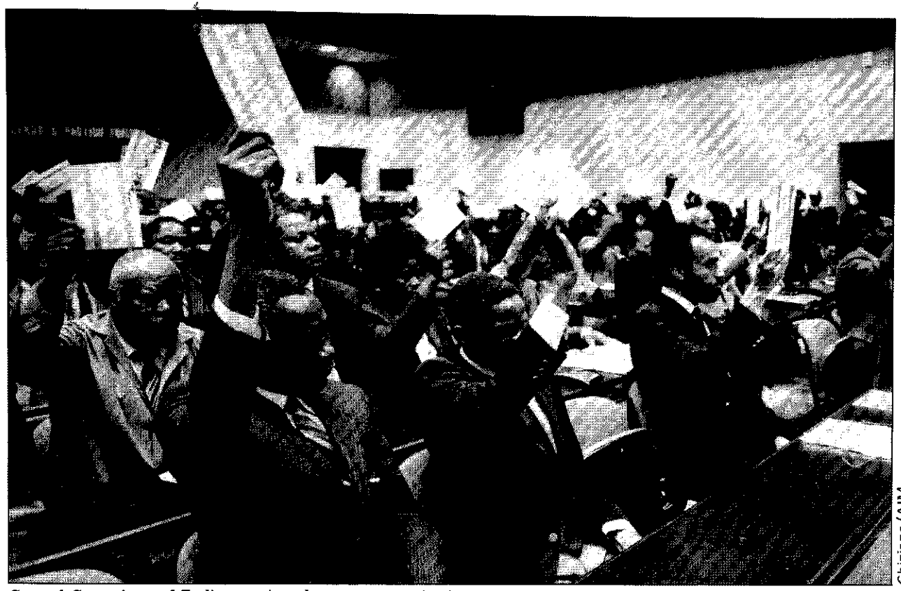
Central Committee of Frelimo voting changes to constitution

Not that this representative himself queried the premise that a wide range of benefits could flow from more or less total immersion in the international market-place. But it was rather disconcerting, as I said in my own address to the conference, to find the World Bank standing marginally to the left of spokespersons from the Mozambican government! Equally disconcerting, I continued, was the small inclination on the part of any of the Ministers to take seriously the fact that, even if a certain kind of socialism could be said to have "failed," there was still good reason for measured scepticism as to whether capitalism could succeed under the conditions in which Mozambique finds itself.