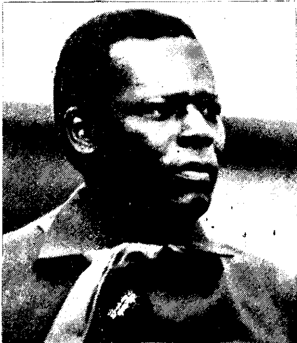
Eduardo dos Santos

In the international field Angola is likely to continue to expand its