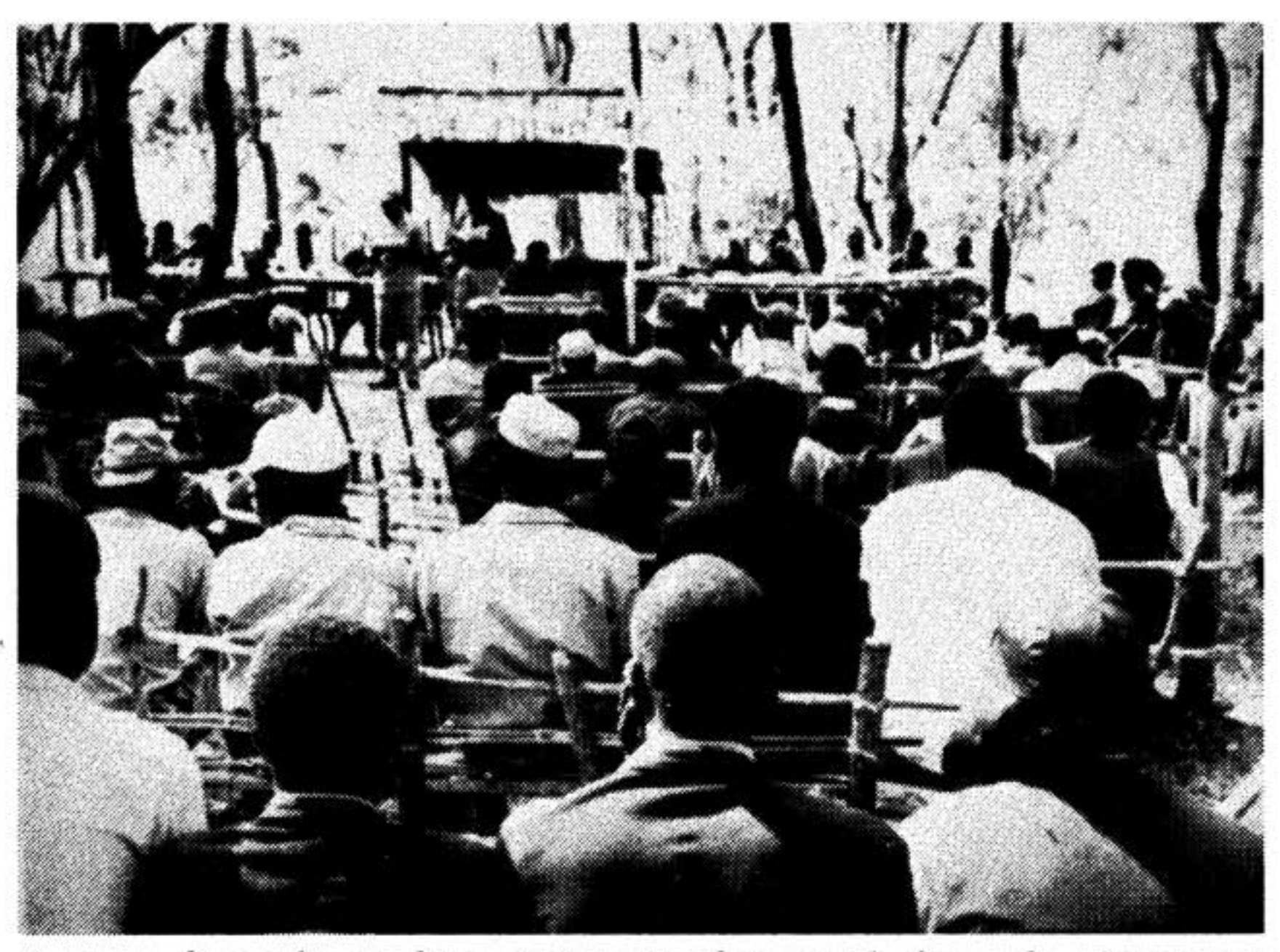
A scene from the Frelimo Congress. Photograph from the Committee for Freedom in Mozambique, 1 Antrim Road, London, N.W.3, whose new pamphlet "Mozambique—a country at war" is available at 1s. per copy.

A consistent dedication to the heroic national task has, however, led to a situation in which some of the cadres who underwent these